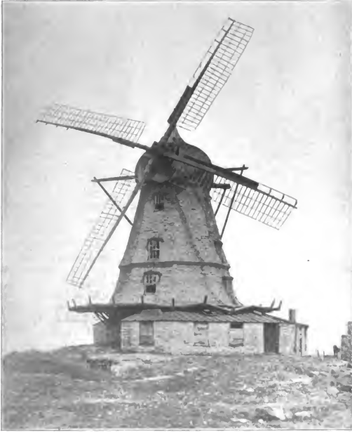
OLD WINDMILL AT LAWRENCE. (One of Kansas' first factories.)

but the milling industry, second in number, was first in value of products with an output of $2,938,215. From this time until 1885, flour and feed milling was the leading industry of the state, and the most widely distributed. The mills were usually small, one-third were run by water power and the remainder by steam, with the exception of a